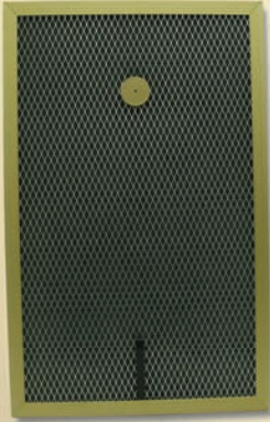
With Patented Cleaning Alarm