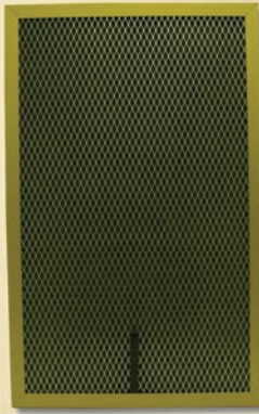
Classic Air Filter